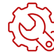
Construction & Engineering