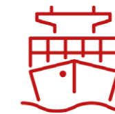
Shipbuilding & Marine