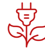
Waste to Energy