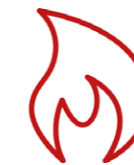
Gas & Oil